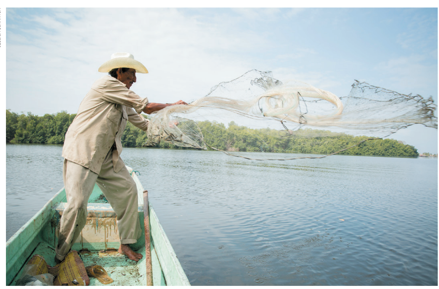
The impact of sustainability measures such as Mexico's Encrucijada Biosphere Reserve can be assessed by aggregating existing reviews and impact evaluations.

CONSERVATION Analysis questions EU funding priorities p.193