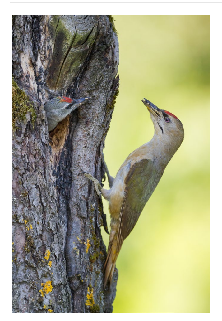
FIGURE 1 Grey-headed Woodpecker ( Picus canus ssp. canus ), Germany.